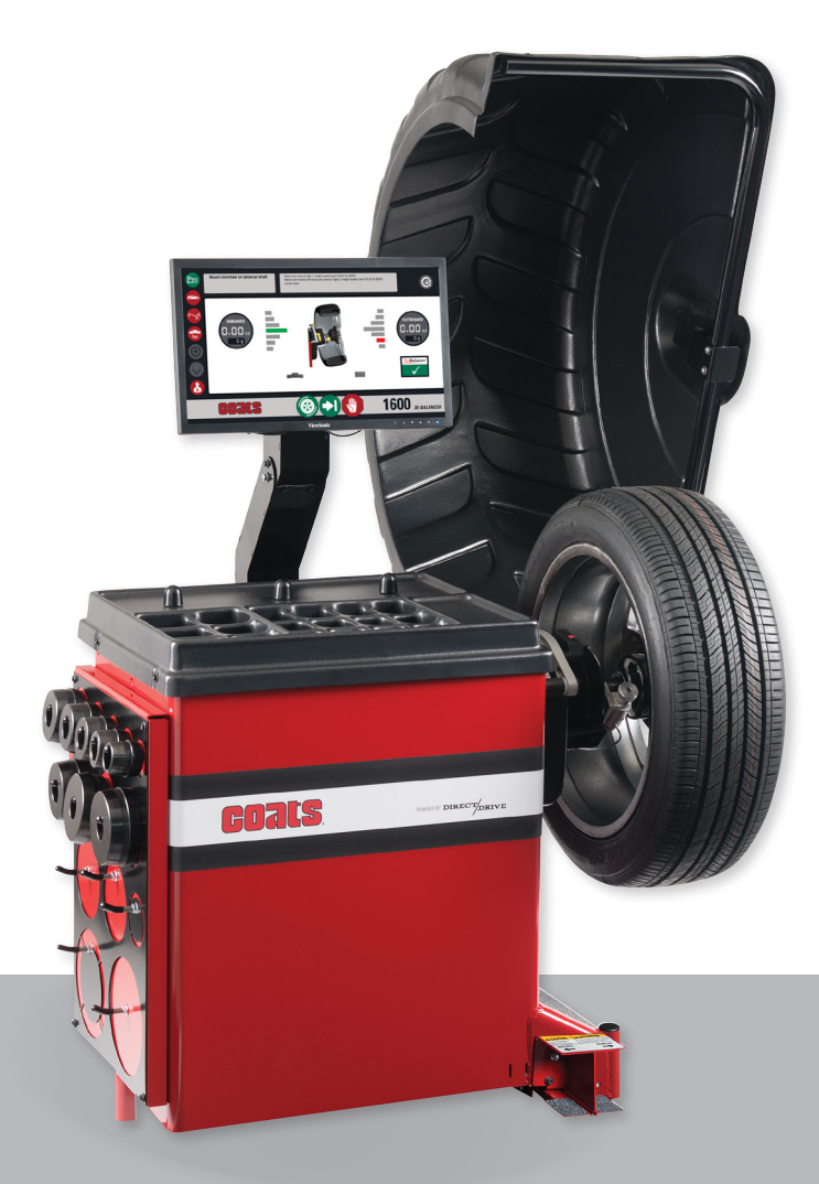
Powered by Direct Drive

Legendary reliability with state of the art capability.