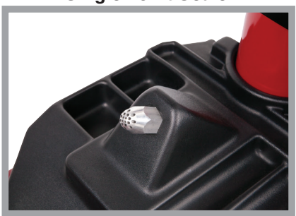
This feature concentrates air flow to seal the beads more efficiently and eliminates excessive maintenance.