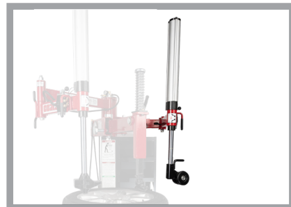
The RoboRoller<sup>™</sup> provides additional power when mounting difficult tire assemblies by preventing the bead from rolling back over the mount tool.

To learn more about Coats products, contact your authorized Coats distributor for the dealer nearest you.