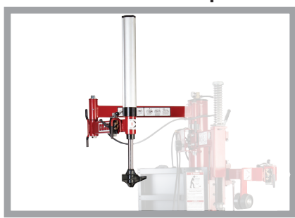
Device assists in efficiently changing low profile or run flat tires.