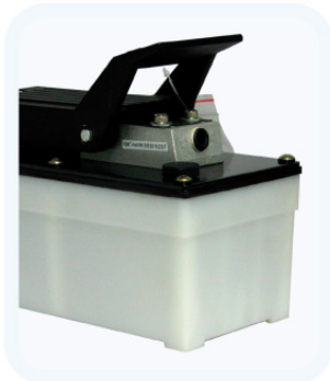
Optional see-through reservoir for easy oil level monitoring.