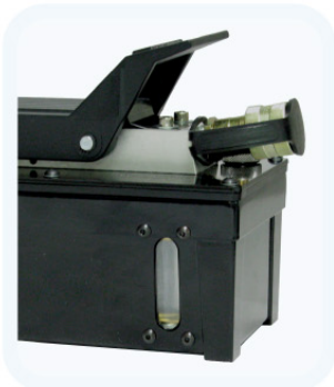
Optional aluminum reservoir with plastic see-through window.